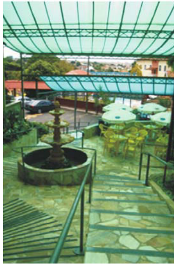
Stairway leading to the entrance